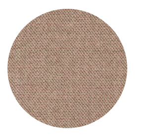
Colour: 4803 Range: Capture