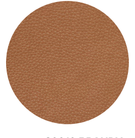
Colour: 30010 BRANDY Range: Sigma