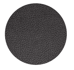
Colour: 30001 BLACK Range: Sigma