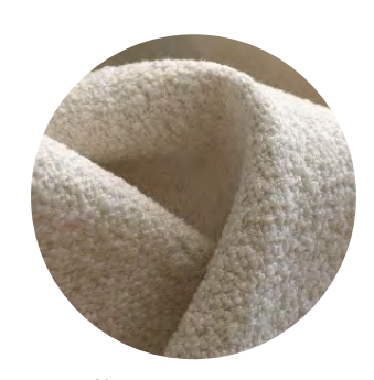
Alpine comes in many different colors.

* Washable at 30 degrees machine wash. When washing always wash the cover inside out and put the cover directly back on the furniture, so it can dry evenly.