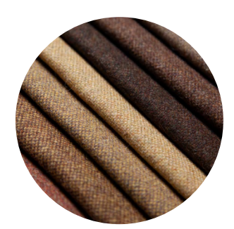
See the many colors on: www.nevotex.com