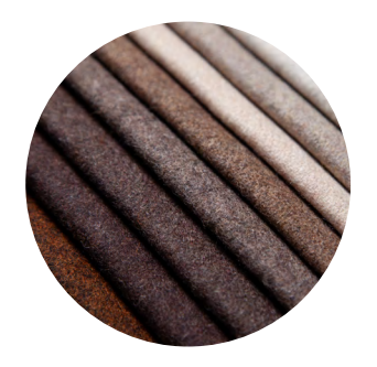
See the many colors on: www.nevotex.com