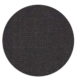
Colour: 5501 Range: Capture