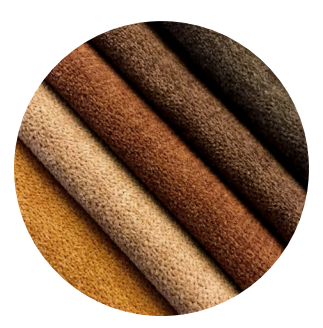
Mine comes in many different colors.

* Washable at 30 degrees machine wash. When washing always wash the cover inside out and put the cover directly back on the furniture, so it can dry evenly.