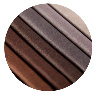
See the many colors on: www.nevotex.com

* Washable at 30 degrees machine wash. When washing always wash the cover inside out and put the cover directly back on the furniture, so it can dry evenly.