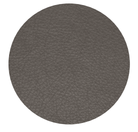
Colour: 30016 SAHARA Range: Sigma