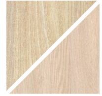
ASH C8 / OAK C8 Soaped

We treated this wood with our 'White oil'.