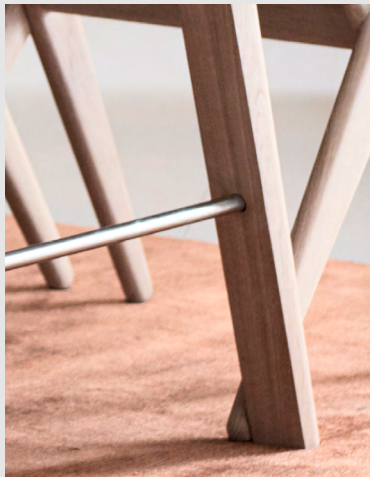
C Brushed stainless steel