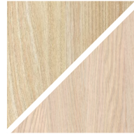
ASH C6 / OAK C6 White oiled

We treated this wood with our 'Natural oil'.