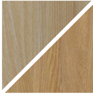
ASH C3 / OAK C3 Lacquered