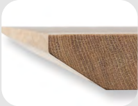
Edge profile 1

Harlekin angled edge profile and rounded corners.