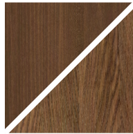
ASH C12 / OAK C12 Antique brown oiled

We treated this wood with our 'Black oil'.