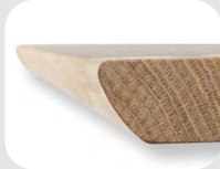
Edge profile 3

Arched edge profile and rounded corners.