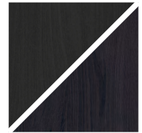
ASH C14 / OAK C14 Black stained & oiled

We treated this wood with our 'Light grey oil'.