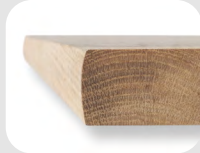
Edge profile 2

Harlekin angled edge profile and rounded corners.