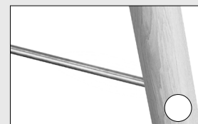
C Brushed stainless steel