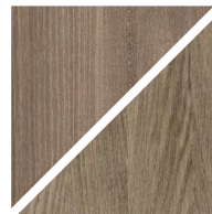
ASH C20 / OAK C20 Grey brown oiled

We treated this wood with our 'Grey brown oil'.