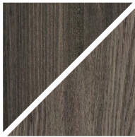
ASH C11 / OAK C11 Dark grey oiled

We treated this wood with our 'Black oil'.