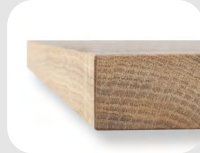
Edge profile 4

Pisa rounded edge profile and rounded corners.