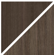
ASH C15 / OAK C15 Mocca brown oiled

C14 is for legs and storage furniture only!