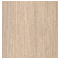
ASH C16 Warm white oiled

We treated this wood with our 'Mocca brown oil'.