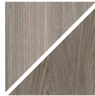
ASH C13 / OAK C13 Light grey oiled

We treated this wood with our 'Antique brown oil'.