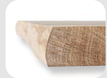
Edge profile R

Straight edge profile and rounded corners.