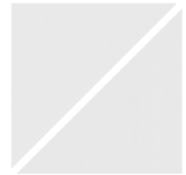
ASH C14 / OAK C14 Black stained & oiled

We treated this wood with our 'Light grey oil'.